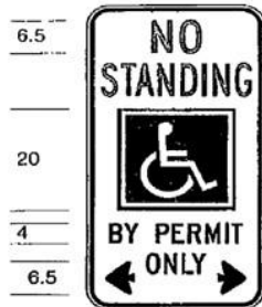
DISABLED STANDING EXEMPTION Sign

Rb-94 30 cm x 60 cm Font Helvetica Bold Condensed Colour "NO STANDING" Legend -- Red Reflective Symbol of Access and Symbol Border -- Blue Reflective Rest of Legend & Border -- Black Background -- White Reflective