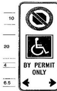
DISABLED STOPPING EXEMPTION Sign

Rb-95 30 cm x 75 cm Font Helvetica Bold Condensed Colour Interdictory Symbol -- Red Reflective Symbol of Access and Symbol Border -- Blue Reflective Legend & Border -- Black Background -- White Reflective