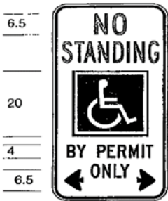
DISABLED STANDING EXEMPTION Sign

Rb-94 30 cm x 60 cm Font Helvetica Bold Condensed Colour "NO STANDING" Legend - Red Reflective Symbol of Access and Symbol Border - Blue Reflective Rest of Legend & Border - Black Background - White Reflective