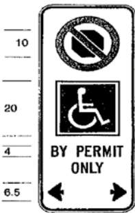
DISABLED STOPPING EXEMPTION Sign

Rb-95 30 cm x 75 cm Font Helvetica Bold Condensed Colour Interdictory Symbol - Red Reflective Symbol of Access and Symbol Border - Blue Reflective Legend & Border - Black Background - White Reflective